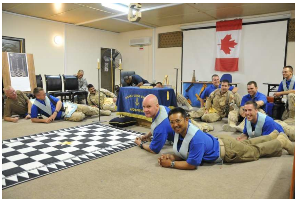
Canada Lodge Kandahar – Under Rocket Attack (Seem kinda happy, don't they?)