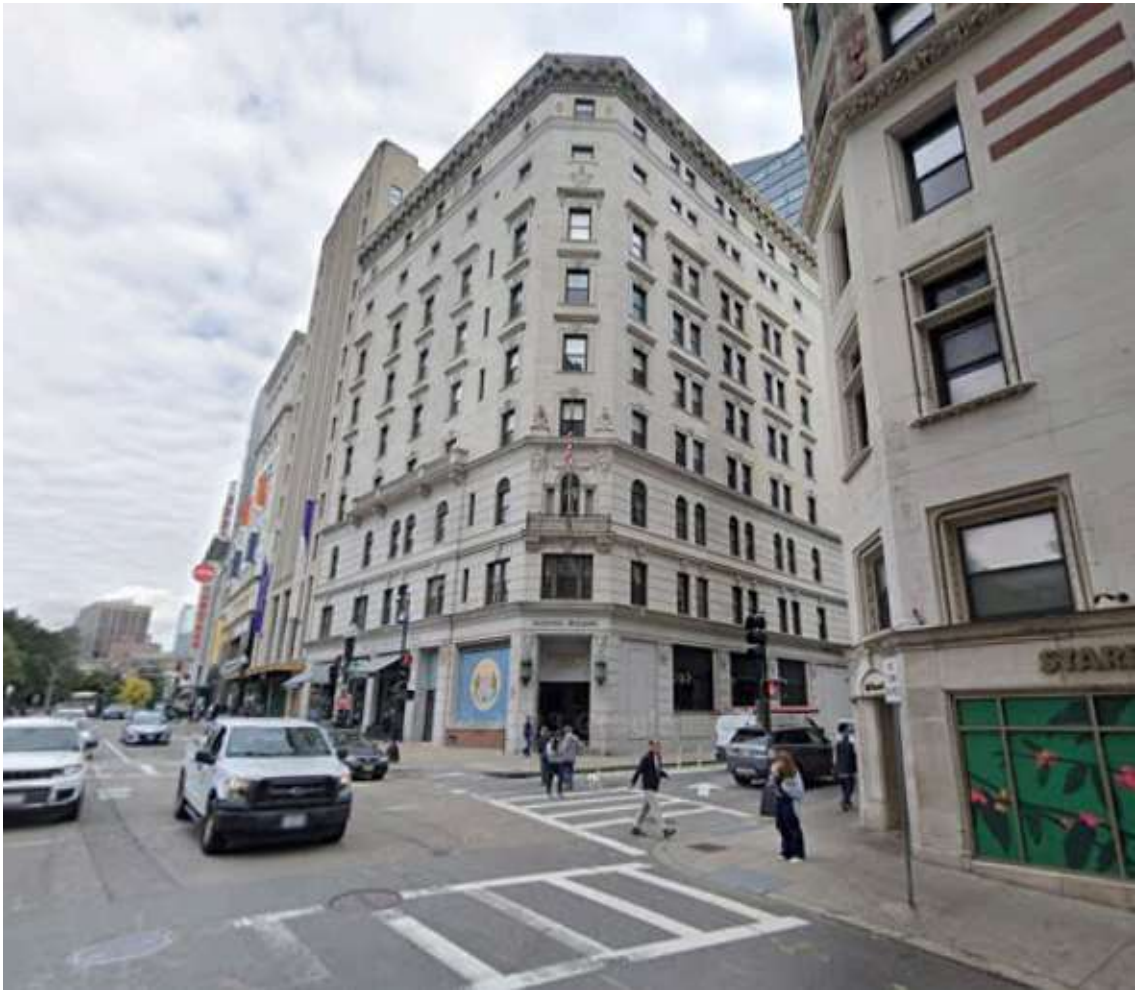
St. Johns Lodge 186 Tremont Street Boston, MA 02111