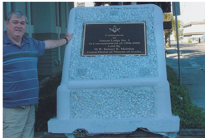
Fairbanks, Alaska (cornerstone)

Do you have a picture of a Masonic building in downtown Some-Place-Else? Send it in. Let everybody see.