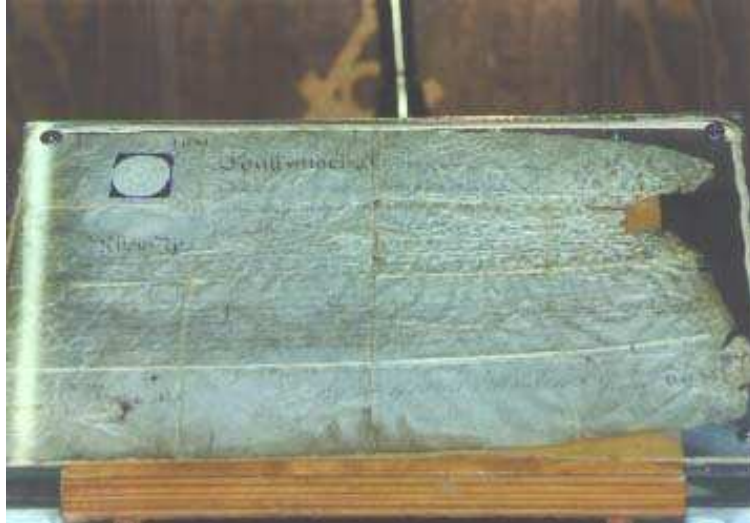
African Lodge #459 Charter

September 20, 2009 will be the 225 th anniversary since African Lodge No. 459 was warranted by the Grand Lodge of England (Moderns) on September 20, 1784.