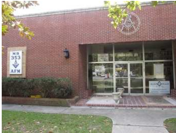
Myrtle Beach, South Carolina

Do you have a picture of a Masonic Hall in downtown Some-Place-Else? Send it in and let others see.