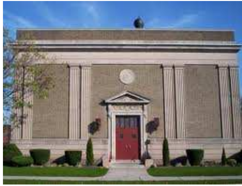
Oshawa Masonic Temple, Ontario

Do you have a picture of a Masonic building in downtown Some-Place-Else? Send it in. Let everybody see.