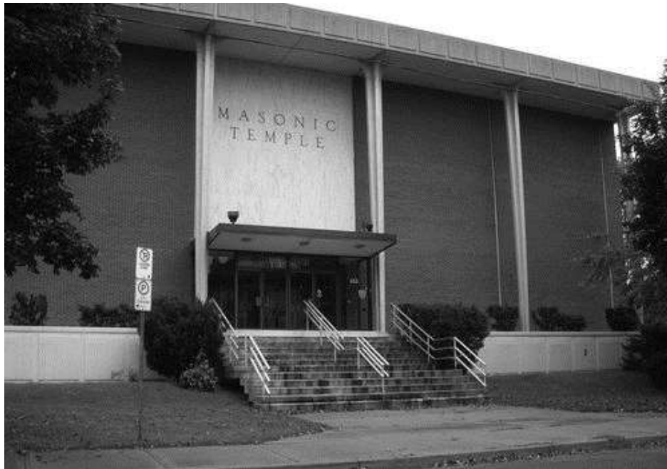
London ON - Main Temple with thanks to Joe Parker - Temple Lodge #597

Do you have a picture of a Masonic Hall in downtown Some-Place-Else? Send it in and let others see.