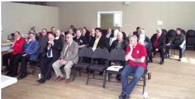
It was early

Brethren of the district who have put their names forward for Grand Lodge office introduced themselves.