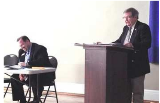
Who was keeping them alert