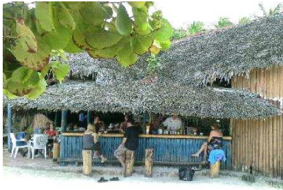
The Beach Bar

The Officers and Brethren of Quinte St, Alban's Lodge No. 620 G.R.C. extend an invitation to all Masons in Ontario to join them in this fraternal visit, and a week of sun and relaxation. The Cuban brethren have been notified and are delighted to welcome us again. We will attend their regular meeting of February 11 (planned a 1 st degree) and we will host a Dinner with our Cuban brethren and their families on February 12, including a City Tour, a visit to a cigar factory and to an elementary school, and cultural entertainment.