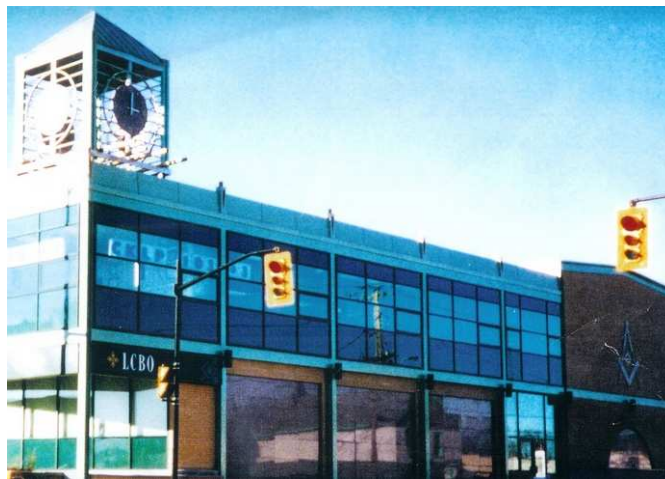
Granite Lodge in Parry Sound, Ontario

Do you have a picture of a Masonic building in downtown Some-Place-Else? Send it in. Let everybody see.